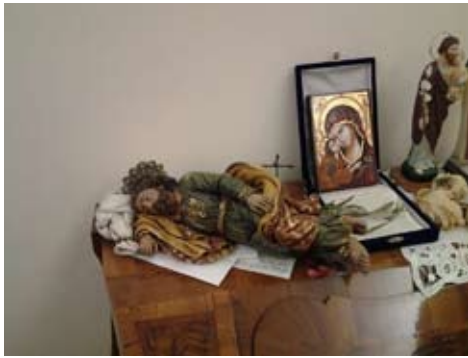
Pope Francis' statuette of Dormant St Joseph

3. Be prophetic voices within our communities. St. Joseph heeded the voice of the Angel and responded to God's call... and together with Mary he was a model for the child Jesus during his growing years. When families have children, and train them in the faith and sound values, and teach them to contribute to society, they become a blessing in our world. God's love becomes present and active by the way we love and by the good works we do. Thus we extend Christ's kingdom in this world.