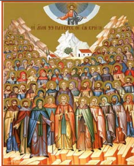
1st November Solemnity of All Saints