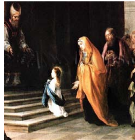
The Presentation of the Blessed Virgin Mary (Mary enters the Temple) 21 November