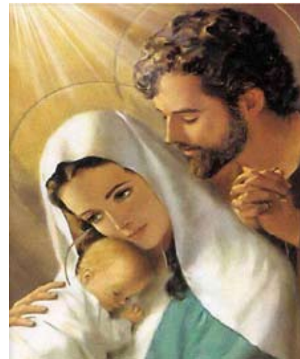
Wishing you all Christmas blessings!